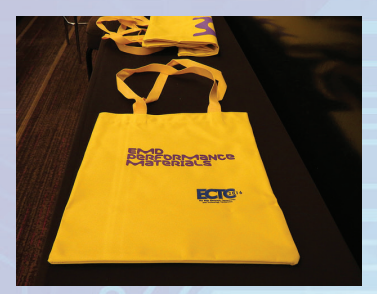
Tote Bag Sponsorship