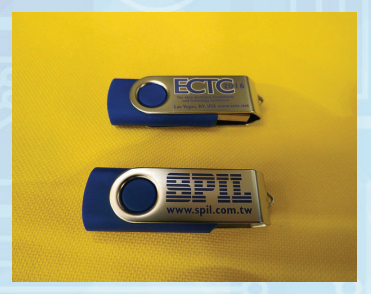
Proceedings on Thumb Drive